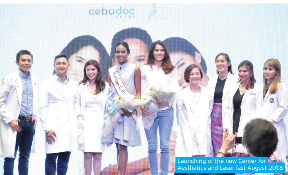
Launching of the new Center for Aesthetics and Laser last August 2018

In the meantime, the Center for Aesthetics and Laser is now serving dermatological and reconstructive surgical procedures. Visit them on the 5th floor of the Medical Arts Building 2 at Cebu Doctors University Hospital. For inquiries, you may call +63 32 255 5555 loc 2250.